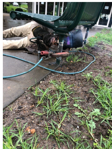
Andrew lifting the height of the seating out the front of the Church.

St Thomas prayers are asked for the following Parishioners: